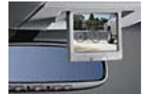
Back-Up Camera w/Monitor $695.00 Installed MSRP*