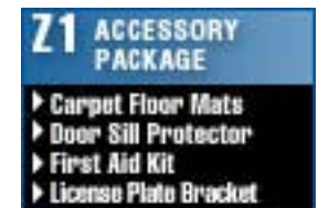
Z1 Preferred Accessory Package ▶ Carpet Floor Mats ▶ Door Sill Protector ▶ First Aid Kit ▶ License Plate Bracket Z1 Preferred Accessory Package Regular Cab $153.00 Double Cab $220.00 CrewMax $233.00 Installed MSRP*