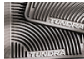
All Weather Mats Regular Cab $55.00 Double/CrewMax $99.00 Installed MSRP*