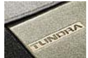
Carpet Floor Mats w/Door Sill Protector Regular Cab $111.00 Double Cab $178.00 CrewMax $181.00 Installed MSRP*