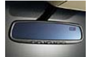
Auto Dimming Mirror $280.00 Installed MSRP*