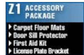
Z1 Accessory Package ▶ Carpet Floor Mats ▶ Door Sill Protector ▶ First Aid Kit ▶ License Plate Bracket Z1 Preferred Accessory Package Regular Cab $153.00 Double Cab $220.00 CrewMax $233.00 Installed MSRP*