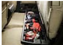
Underseat Storage $125.00 Installed MSRP*