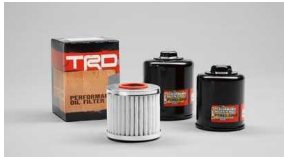
TRD Oil Filter $13 Parts Only MSRP**