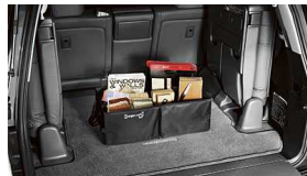
Cargo Tote $40 Installed MSRP*