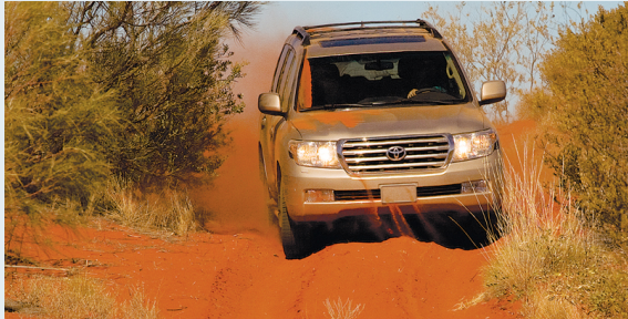
2010 Land Cruiser shown in Sonora Gold Pearl with available Upgrade Package