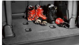
Cargo Mat $95 Installed MSRP*