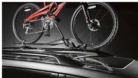
Bike Attachment with Adapters $244 Parts Only MSRP**