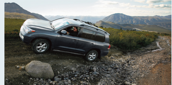
2010 Land Cruiser shown in Magnetic Gray Metallic with available Upgrade Package