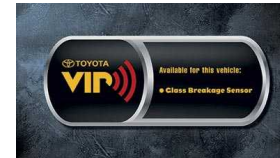
Glass Breakage Sensor (GBS) $205 Installed MSRP*