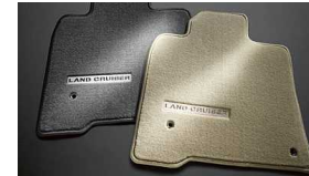
Carpet Floor Mats (3-Piece) $109 Installed MSRP*