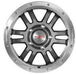
TRD 17" Forged Off-road Alloy Wheels $3,199 Installed MSRP*