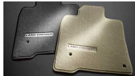
Carpet Floor Mat/Cargo Mat $209 Installed MSRP*