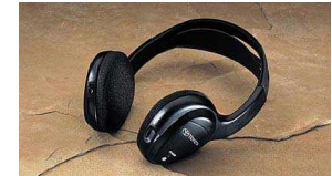
Wireless Headphones (pair) $82 Installed MSRP*