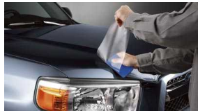
Paint Protection Film $395 Installed MSRP*