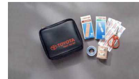
First Aid Kit $29 Installed MSRP*