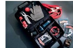
Emergency Assistance Kit $70 Installed MSRP*