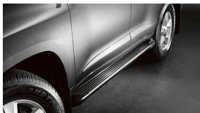
Body Side Molding $375 Installed MSRP*