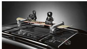
Ski Attachment with Adapters $225 Parts Only MSRP**