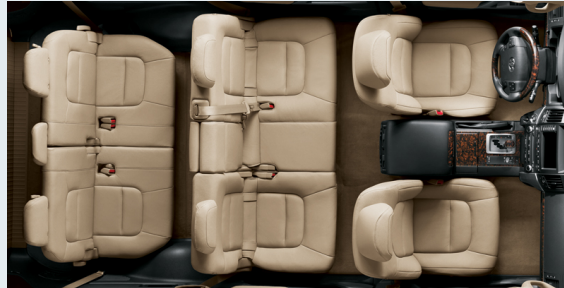
Land Cruiser interior shown in Sand Beige