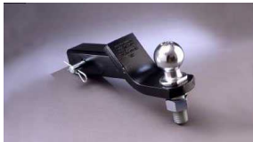
Ball Mount & Trailer Ball $69 Parts Only MSRP**