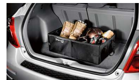
Cargo Tote $40 Installed MSRP*