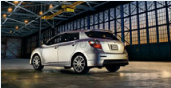
XRS shown in Classic Silver Metallic