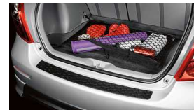
Cargo Net $51 Installed MSRP*