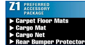
Preferred Accessory Package $330 Installed MSRP*