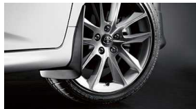
Mudguards Rear (2pc set) $36 Installed MSRP*