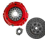
TRD Performance Clutch $650 Parts Only MSRP**