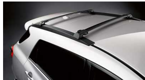
Roof Rack $350 Installed MSRP*