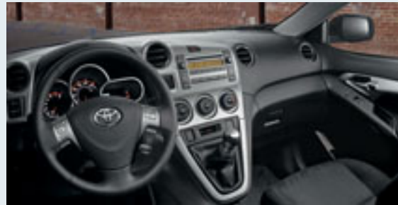
XRS interior shown in Dark Charcoal with available JBL® audio system [20].