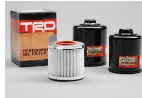
TRD Oil Filter $13 Parts Only MSRP**