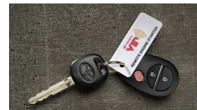
Remote Engine Start $529 Installed MSRP*