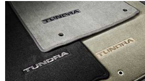
Carpet Floor Mats w/Door Sill Protector $181 Installed MSRP*