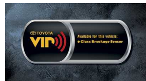
Glass Breakage Sensor (GBS) $165 Installed MSRP*