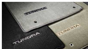
Carpet Floor Mats $115 Installed MSRP*