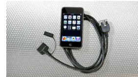
Interface Kit for iPod® $299 Installed MSRP*