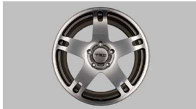
TRD 22"x9" 5-Spoke Polished Forged Aluminum Alloy Wheel $4,699 Installed MSRP*