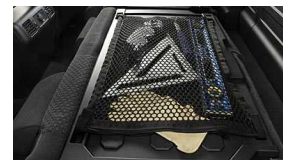
Seat Back Cargo Net $64 Installed MSRP*