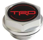
TRD Forged Oil Cap $45 Parts Only MSRP**