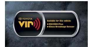
VIP-RS3000 Plus Security System $299 Installed MSRP*