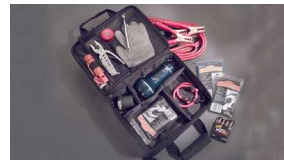
Emergency Assistance Kit $70 Installed MSRP*