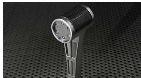
Anodized Aluminum Shift Knob $85 Installed MSRP*