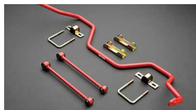
TRD Rear Sway Bar $299 Installed MSRP*