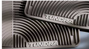
All Weather Floor Mats $99 Installed MSRP*