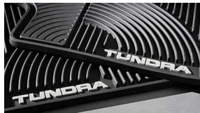
All Weather Floor Mats w/ Door Sill Protector $165 Installed MSRP*