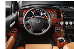
Molded Simulated Burlwood Dash Applique by Superior Dash $350 Installed MSRP*