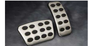
Sport Pedal Stainless Steel $85 Installed MSRP*