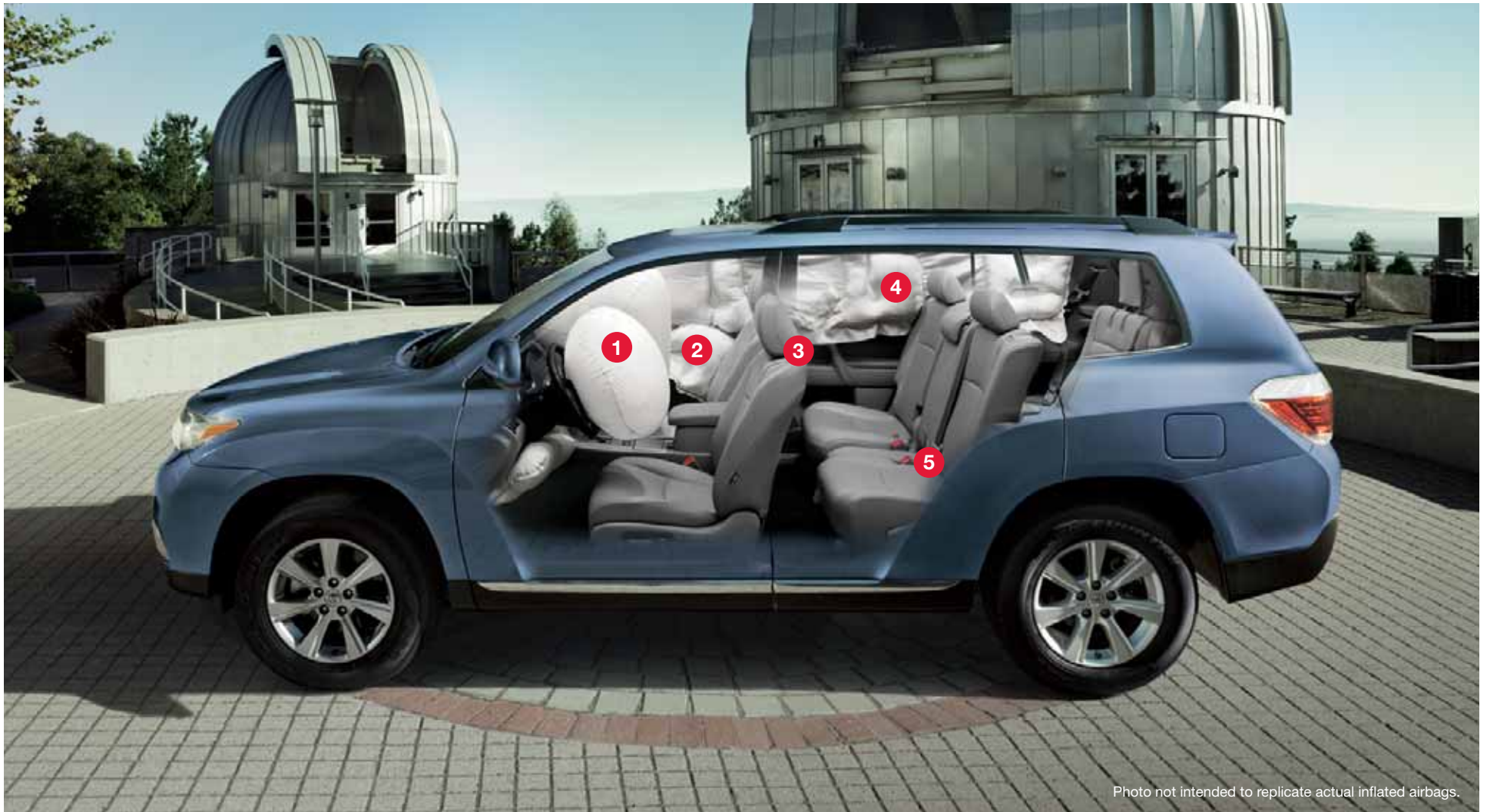
Photo not intended to replicate actual inflated airbags.

LATCH (Lower Anchors and Tethers for Children) includes lower anchors and tethers on all outboard second-row seats.