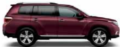
SIZZLING CRIMSON MICA Black 9 Ash or Sand Beige interior