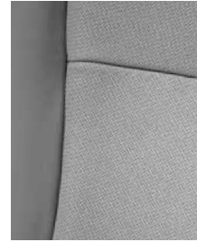
Limited and Hybrid Limited perforated leather in Ash