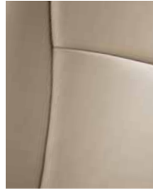
Hybrid available/SE standard leather in Sand Beige