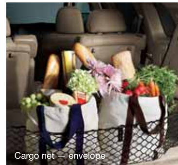
Cargo net – envelope