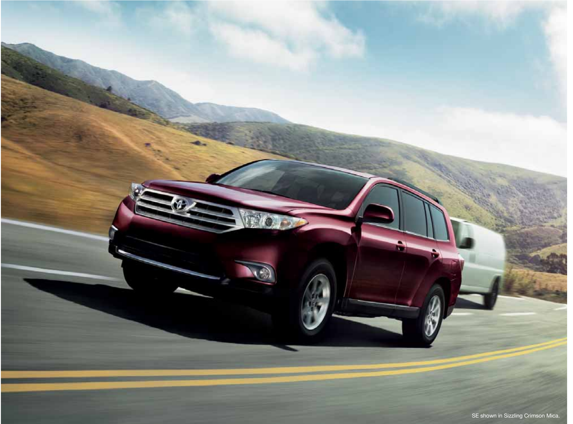
SE shown in Sizzling Crimson Mica.