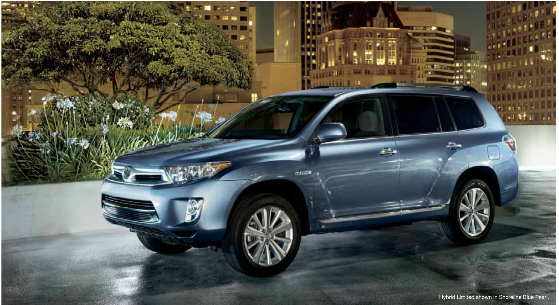
Hybrid Limited shown in Shoreline Blue Pearl.

Starting From initial light or moderate acceleration to low speeds, Highlander Hybrid is powered solely by the high-torque electric motors!