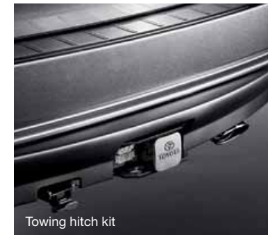
Towing hitch kit