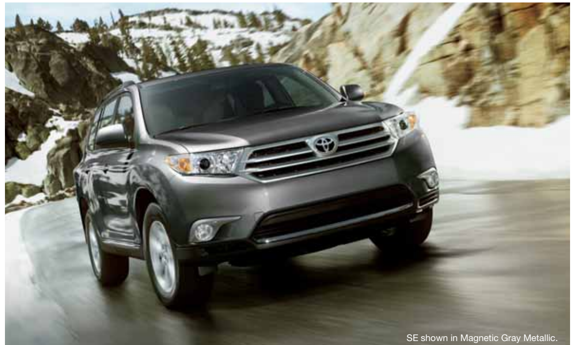
SE shown in Magnetic Gray Metallic.

The Anti-lock Brake System (ABS) that's standard on Highlander is an important element of its active safety capability. Brake Assist (BA) is designed to detect whether the driver is attempting a panic stop, and if so, applies increased braking power. Electronic Brake-force Distribution (EBD) works with ABS and BA to optimize the distribution and amount of brake force between the front and rear wheels, based on driving conditions and vehicle load. When braking during cornering, EBD also distributes brake force between the left and right wheels to help maintain vehicle control.