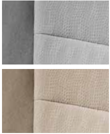
Highlander fabric in Ash or Sand Beige