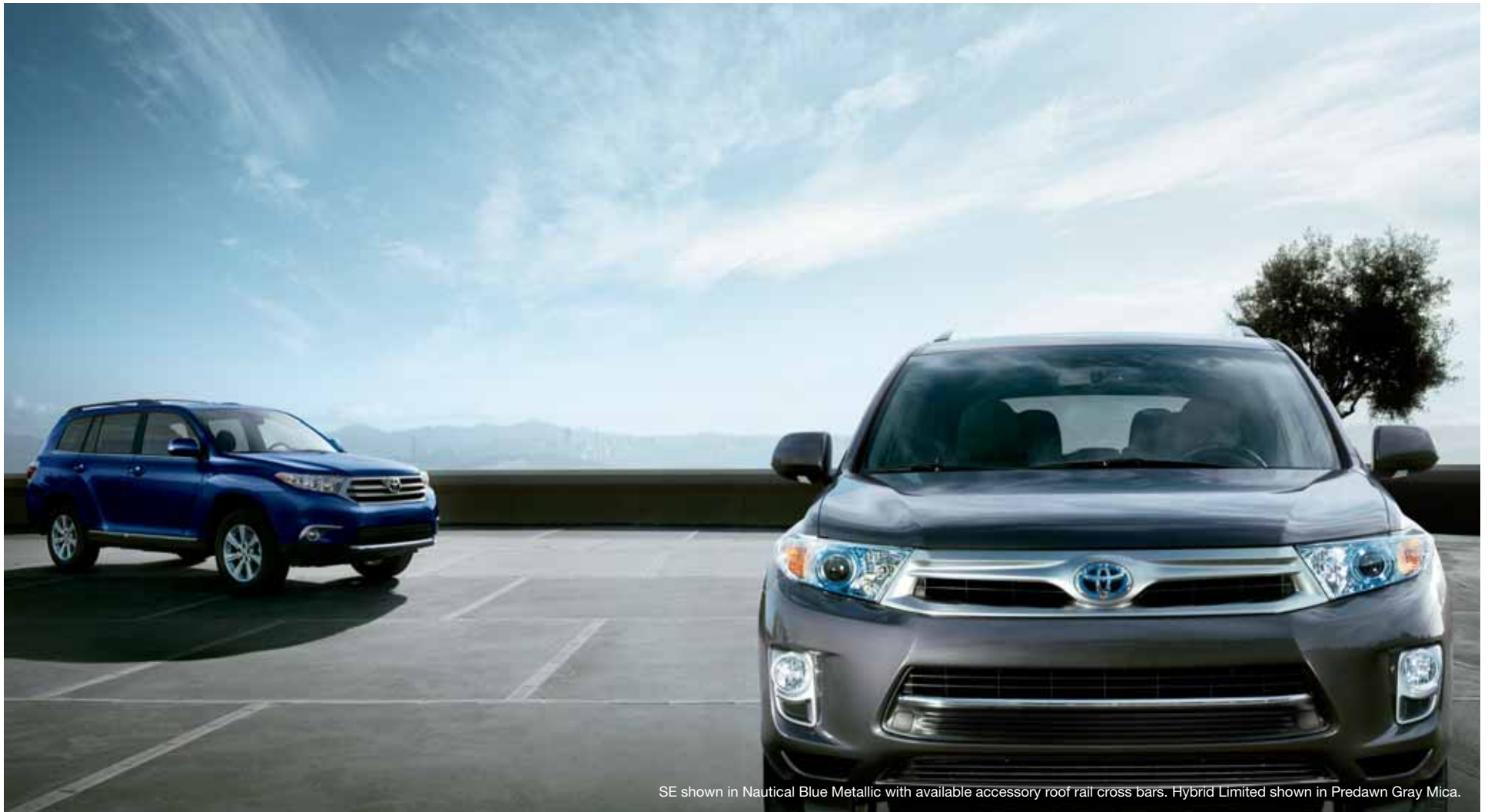
SE shown in Nautical Blue Metallic with available accessory roof rail cross bars. Hybrid Limited shown in Predawn Gray Mica.