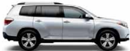
CLASSIC SILVER METALLIC Black 9 or Ash interior