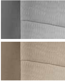
Highlander available/Hybrid standard easy-clean fabric in Ash or Sand Beige