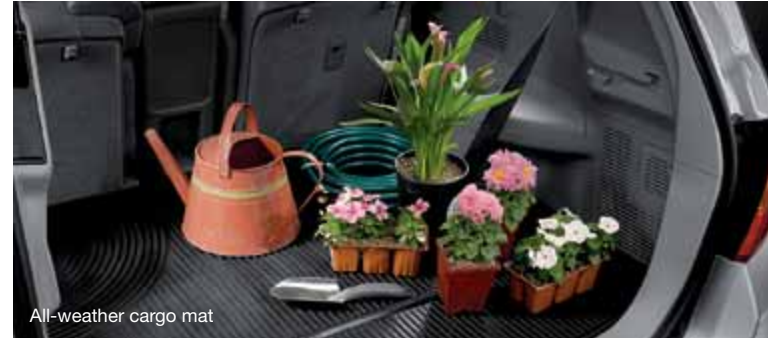
All-weather cargo mat