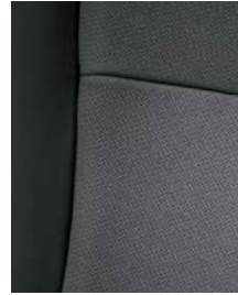
Limited and Hybrid Limited perforated leather in Black