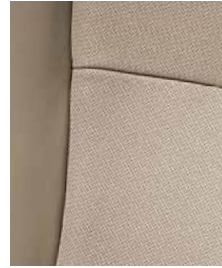
Limited and Hybrid Limited perforated leather in Sand Beige