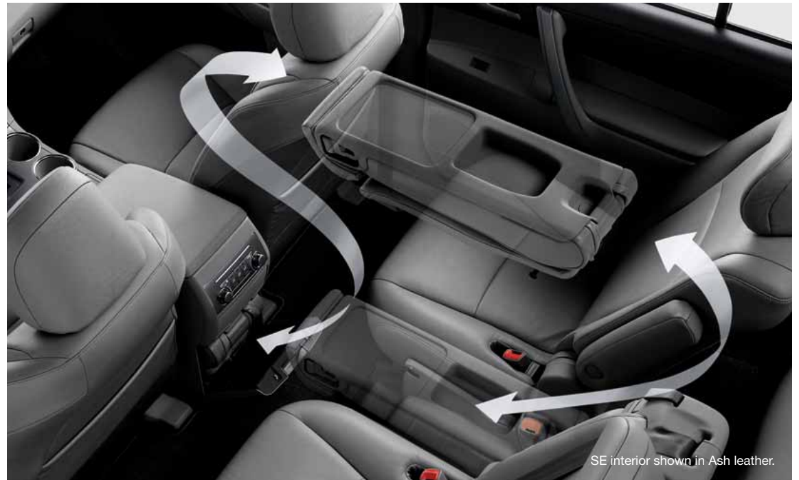
SE interior shown in Ash leather.

This innovative feature adds to Highlander's incredible versatility . Beneath the center console, there's a Center Stow™ seat that you can pull out, lock in place between the second-row captain's chairs and fold open. Remove it, and you've made a walk-through to the third row. Or replace it with the Center Stow™ console to hold drinks and smaller items.