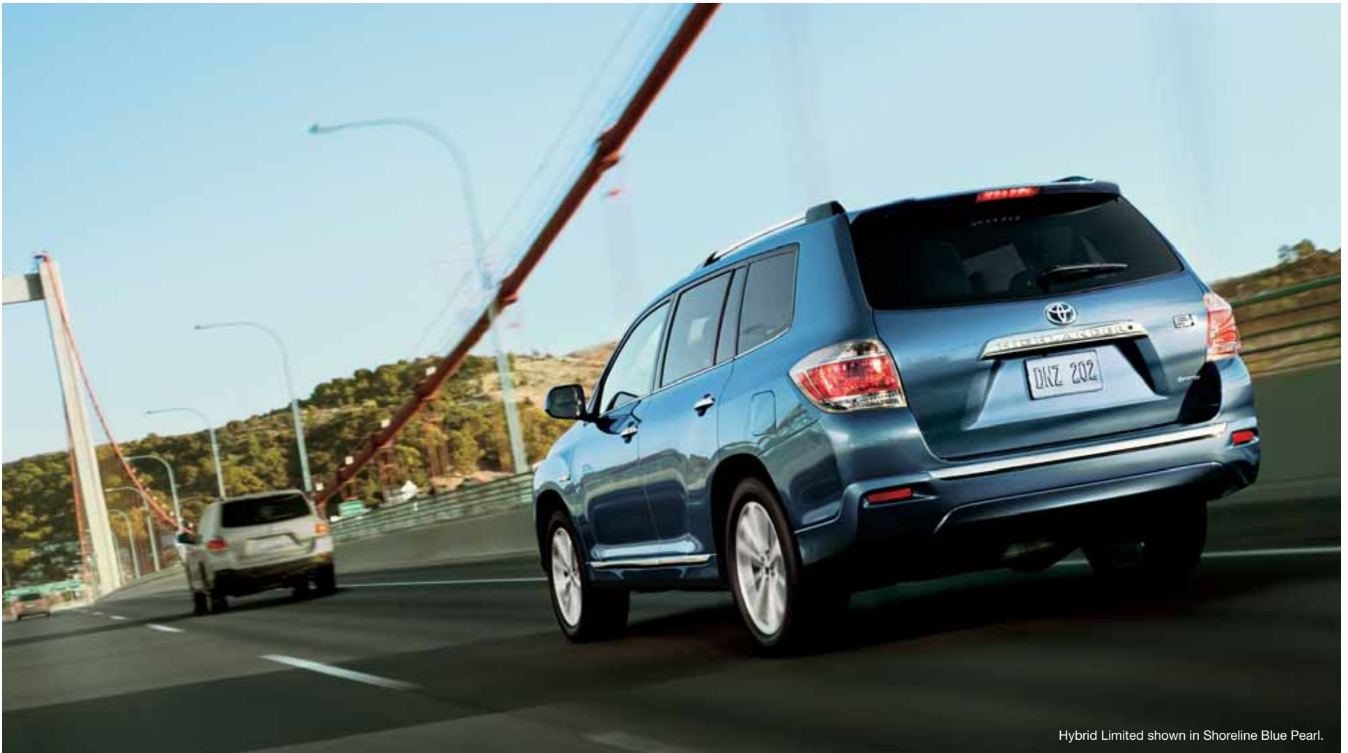
Hybrid Limited shown in Shoreline Blue Pearl.

Eco-conscious? Absolutely. With its three modes of power, Hybrid Synergy Drive® makes Highlander Hybrid highly fuel-efficient, while producing extremely low emissions. Yet it's just as powerful and responsive as the non-hybrid V6. So, what's Highlander Hybrid? Easy: the ultimate no-compromise SUV.