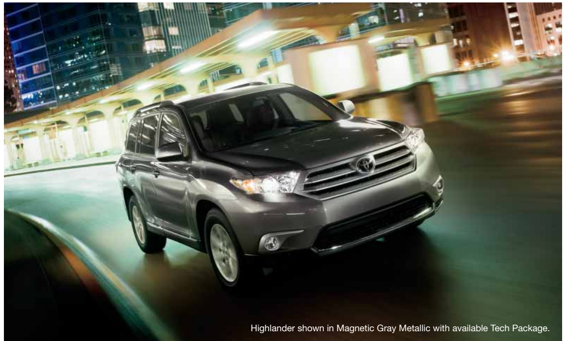
Highlander shown in Magnetic Gray Metallic with available Tech Package.

An available 24-valve V6 engine uses a Double Overhead Cam (DOHC) and Dual VVT-i to deliver 270 hp and 248 lb.-ft. of torque with an EPA-estimated 24 highway mpg rating 2 . Yet Highlander still manages to achieve an Ultra Low Emission Vehicle II (ULEV-II) rating.