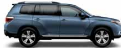
SHORELINE BLUE PEARL Black 9 Ash or Sand Beige interior