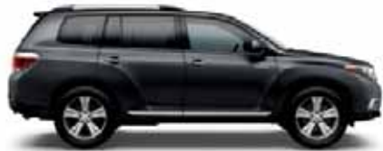
BLACK Black 9 Ash or Sand Beige interior

Highlander is available in ten exterior colors and seven interior colors. Many choices, certainly. But Highlander has been painstakingly engineered to offer quality and versatility, so you really can't go wrong with any of them.