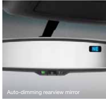
Auto-dimming rearview mirror