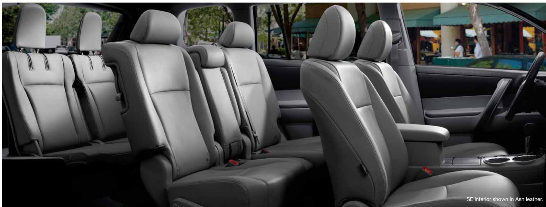
SE interior shown in Ash leather.