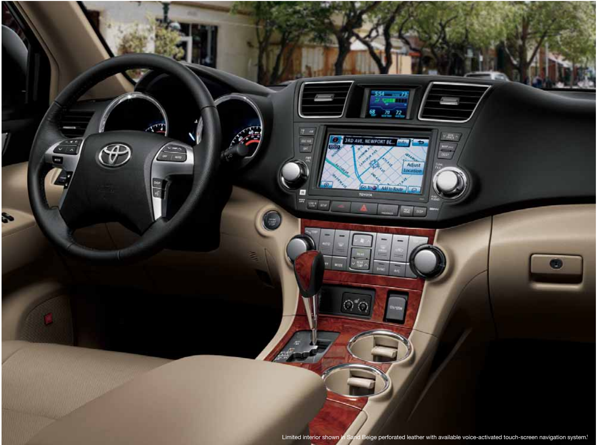
Limited interior shown in Sand Beige perforated leather with available voice-activated touch-screen navigation system 1