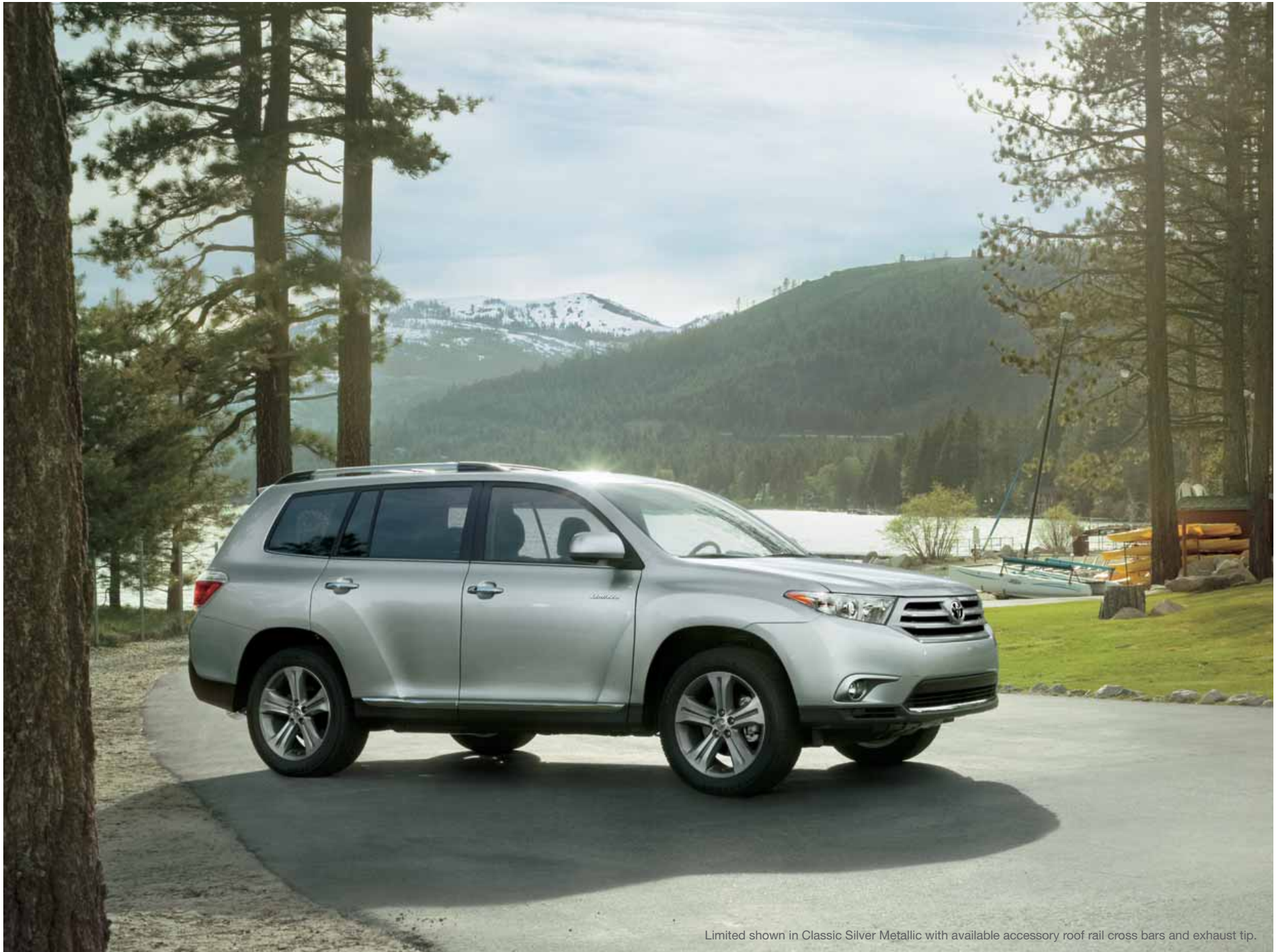
Limited shown in Classic Silver Metallic with available accessory roof rail cross bars and exhaust tip.