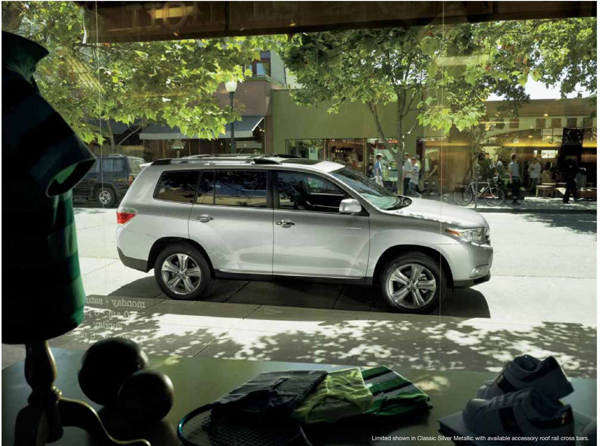
Limited shown in Classic Silver Metallic with available accessory roof rail cross bars.