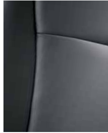
Hybrid available/SE standard leather in Black